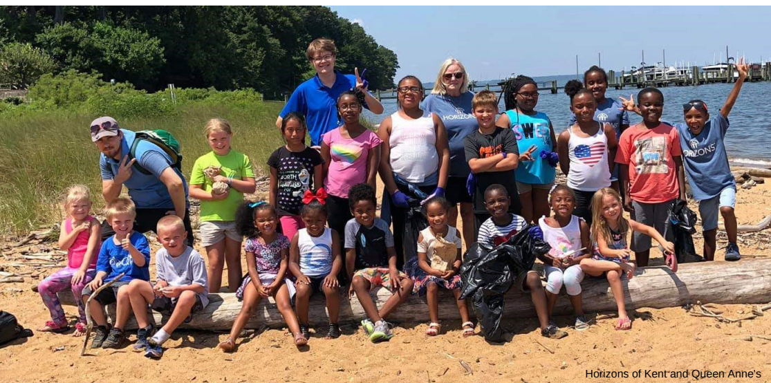
Horizons of Kent and Queen Anne's

Every effort has been made to ensure that the information in this publication is correct. Please direct errors or omissions to the Executive Director and accept our sincere apologies.